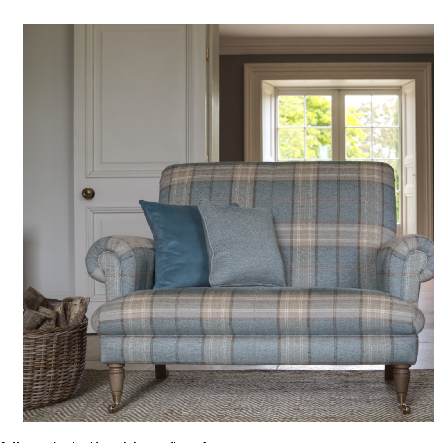
Q: How can I style a blue sofa in a small room?

A: Opt for lighter shades and pair with neutral accents to keep the space feeling open.