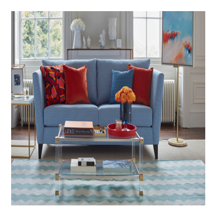
How to Decorate With a Blue Sofa